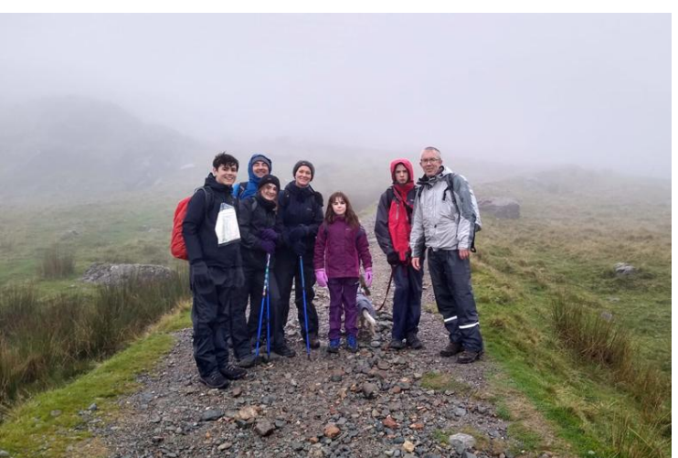
Left: Taking advantage of a small Bothy, Right: Beginning the climb on Walna Scar Road