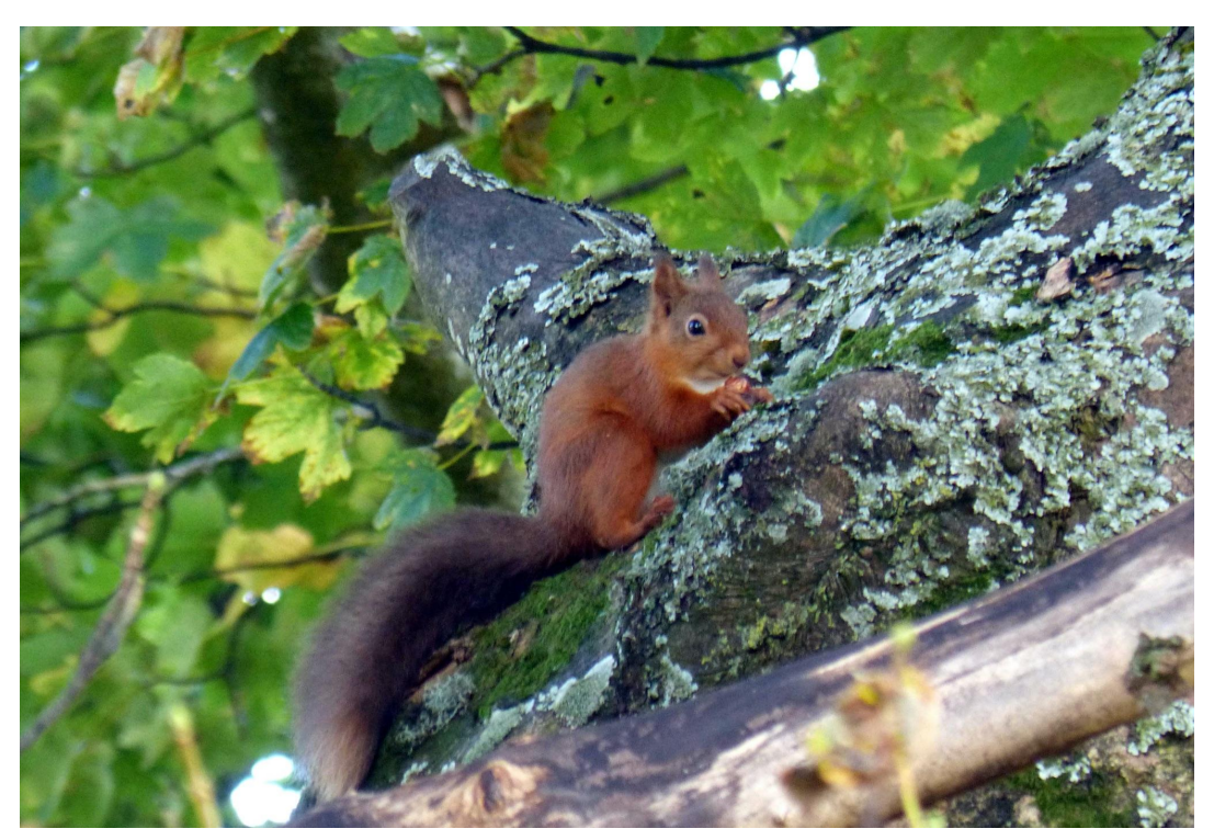
Local resident

A lovely walk to finish our stay for the October meet.