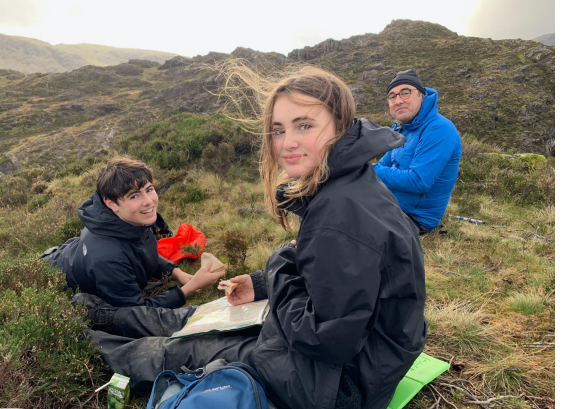
Left: The climb up Fleetwith edge, Right: Lunch at the top of Fleetwick Pike

The Oatens took the longer route, with a steep climb and the odd scrabble up Fleetwith Edge to Fleetwith Pike. This route was in the process of being renovated by 3 chaps who were putting in stone steps where possible to mark out the way.