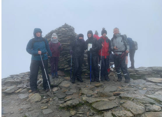
'What a difference a Day makes': the summit of the Old Man of Coniston on Friday... then Saturday.