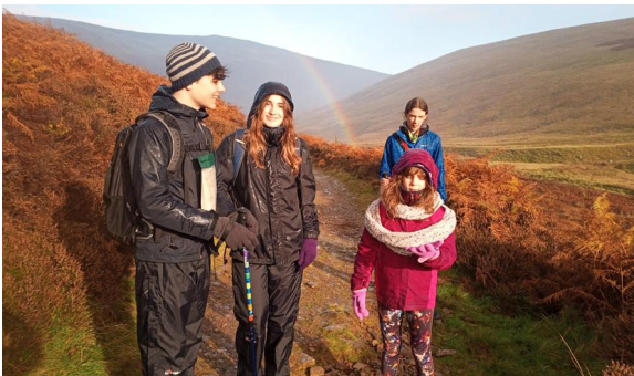
Left: Lunch while reviewing river crossing tactics. Right: Rainbows on the Cumbrian Way